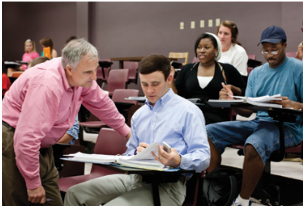
Students learn better when they have more interaction with their professors and other students, and when they ask questions freely. Teachers can help to facilitate the learning process through individual discussions, classroom demonstrations and encouraging students to work in groups.